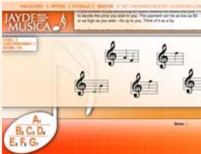
Only a Screen Shot

"I've just been using your music note game this morning and i have to say i'm loving it. I'm going to pass it on to my friends. It really is a big help."